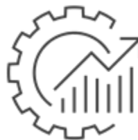
Productivity & Efficiency