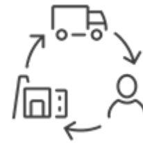
Supply Chain (including modern slavery)