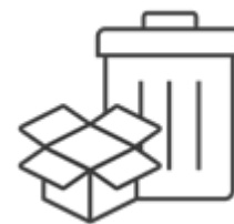
Waste & Packaging

Following the identification of these material topics, an ESG strategy was developed and an ESG Governance Structure was formalised to oversee the implementation of the strategy, with modern slavery prioritised for strategic action. The ESG Governance Structure includes the governance of modern slavery and human trafficking risk and due diligence, and the Board is ultimately responsible for the Group's ESG strategy, reviewing its effectiveness, establishing and communicating ESG-related policies, and reviewing overall progress against the ESG strategy.